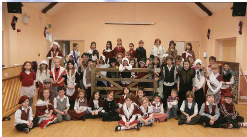
Penboyr Primary School