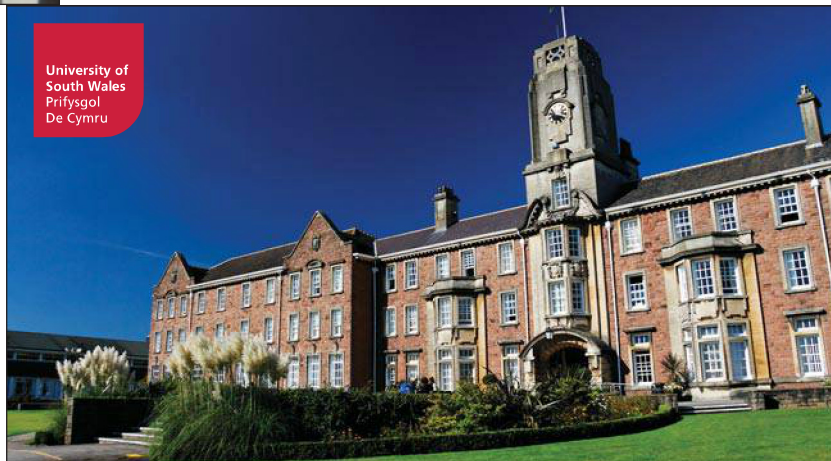
University of South Wales, Caerleon Campus

Supported by National Museum Wales; St Fagans National History Museum; Royal Commission on the Ancient and Historical Monuments of Wales