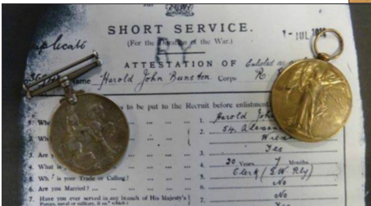
Tasker Milward V.C. School