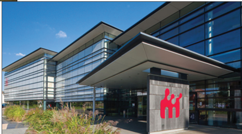
National Waterfront Museum, Swansea

The Association of History Teachers in Wales