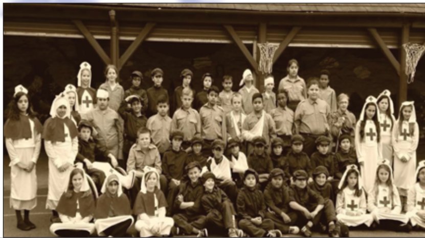
ALBANY Primary School