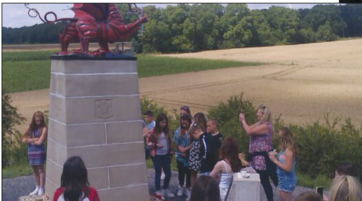
CEFN HENGOED Community School