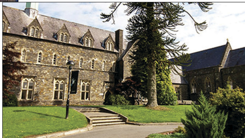
University of Wales Trinity Saint David Carmarthen

Casgliad y Werin Cymru People's Collection Wales