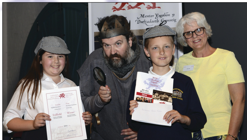
PENTWYNMAWR Primary School